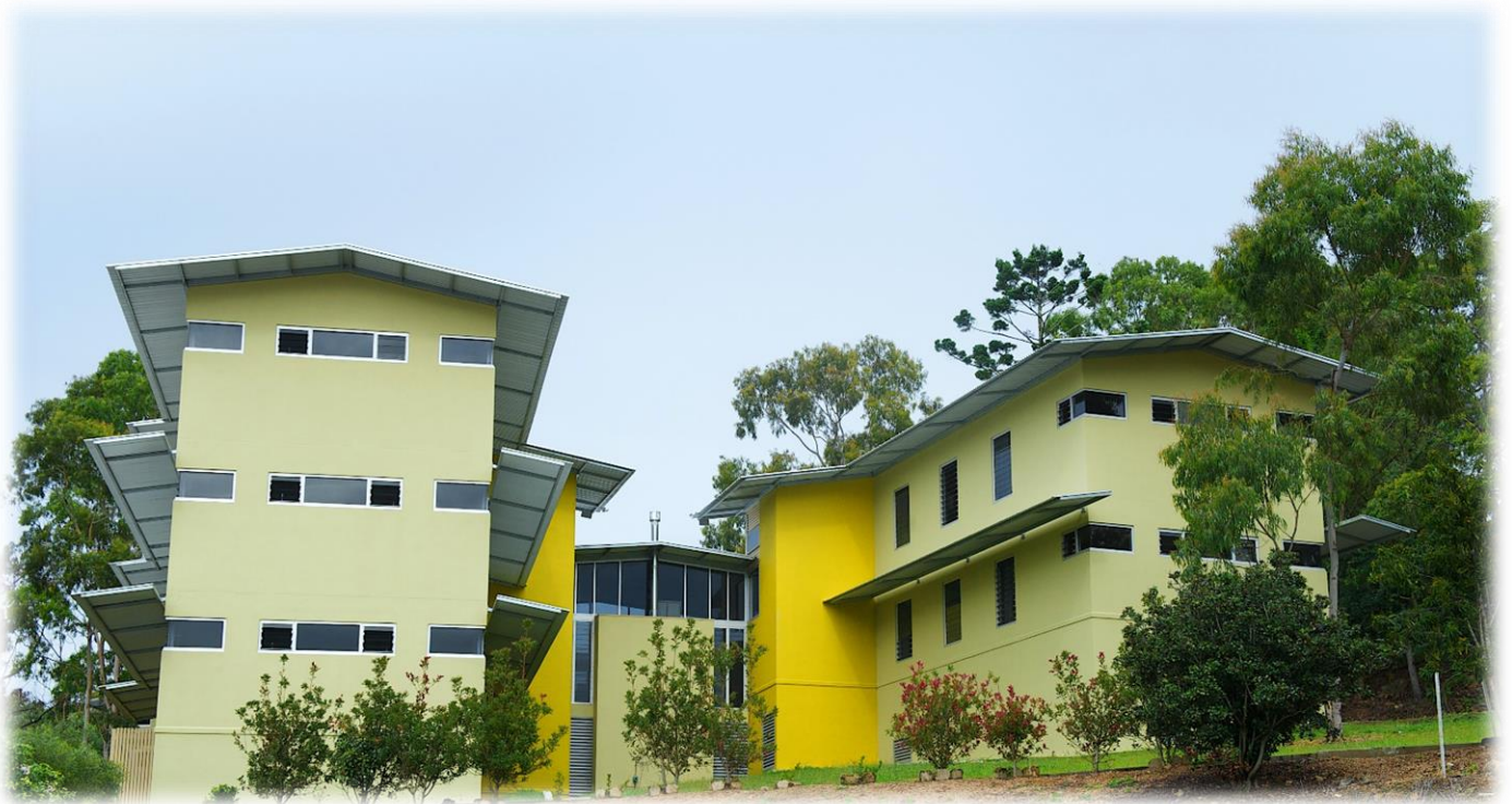
Morrissey (Girls) Boarding House

Should you have any questions, concerns, or information over the course of the year please contact the Residential reception on 07 4096 1504.