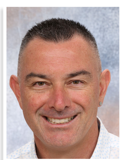
1r Coatt W/bittoro