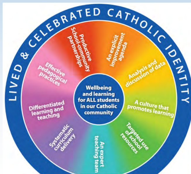
Cairns Diocesan School Effectiveness Framework