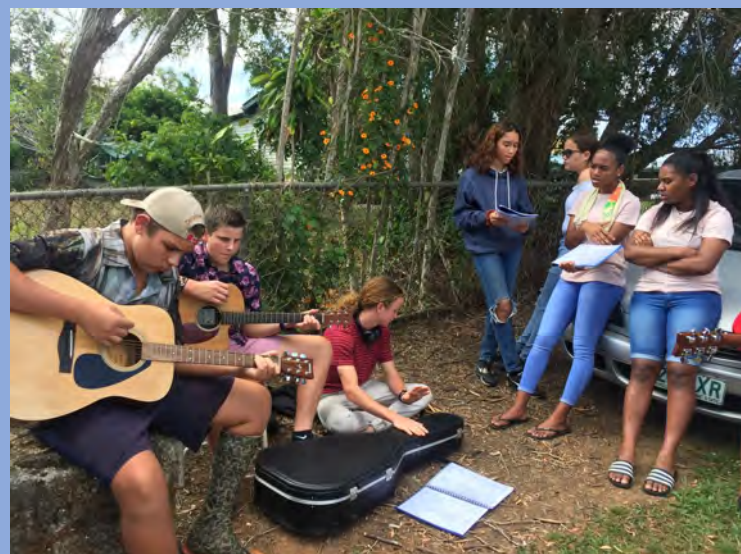
Above—Students warming up before the performance