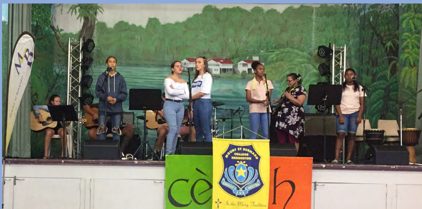
Below—On stage performing proudly for MSB